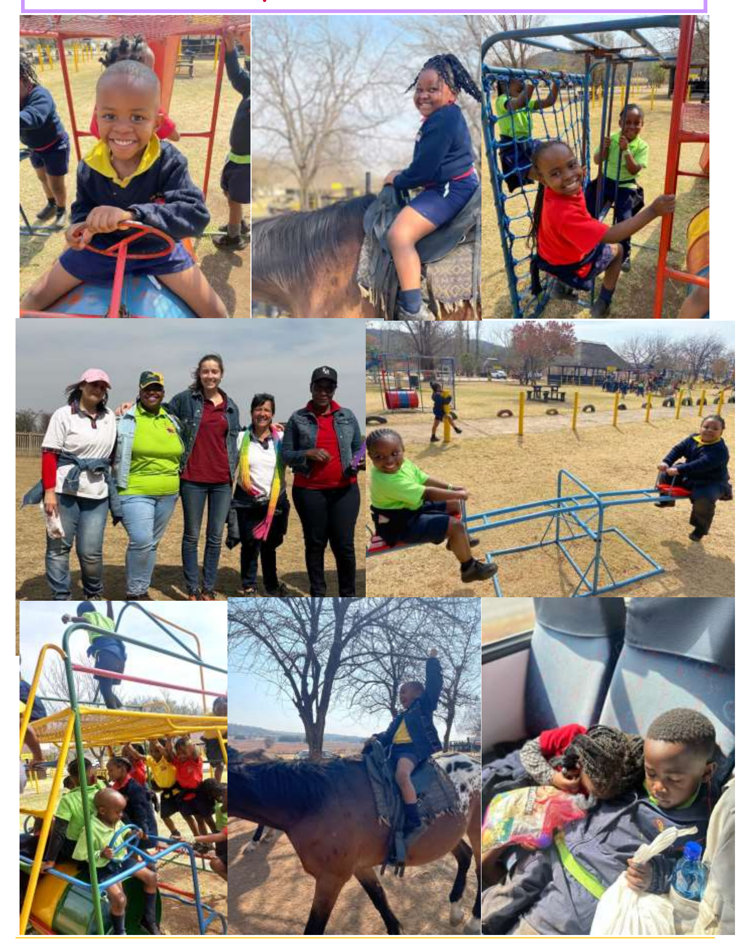
Page 3 Kidz Chronicle The magic of uncertainty