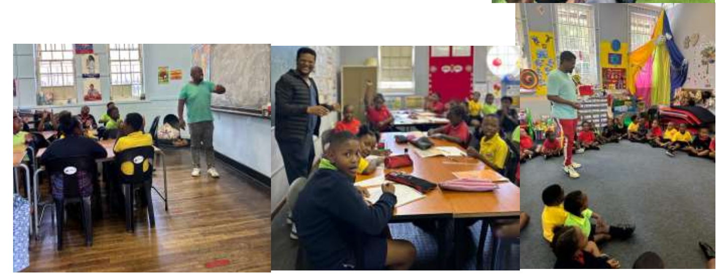
Edition 05/Term 1 Page 5

The goal is to create a fun and supportive environment where learners can learn, grow, and express themselves through music.