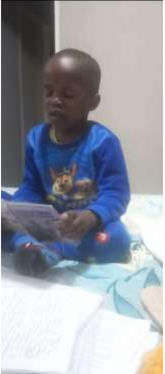
Page 3 Kidz Chronicle