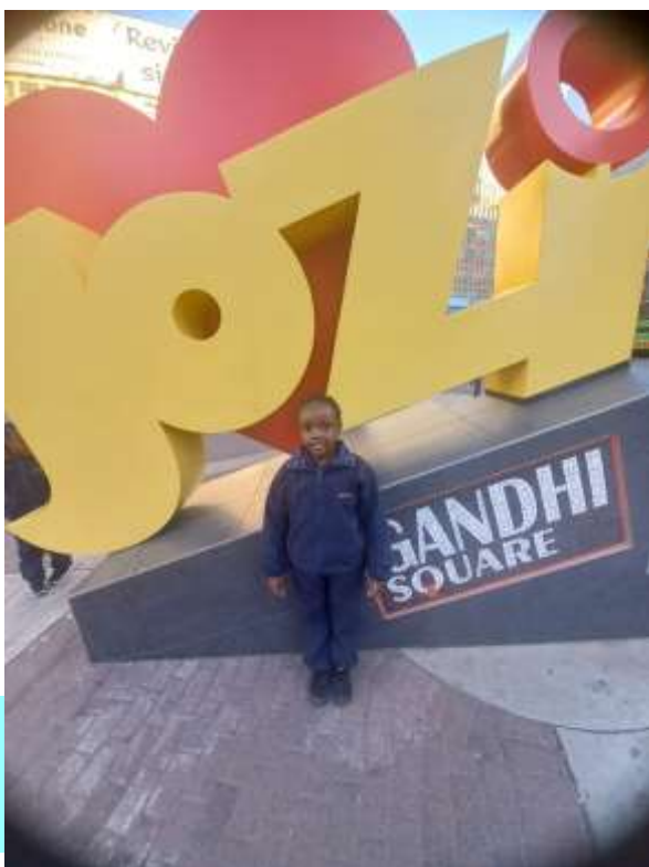
CityKidz Pre & Primary School