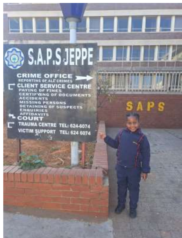
18 Mooi Street, City & Suburban, Johannesburg, 2023 (Entrance 11 Goud Street)