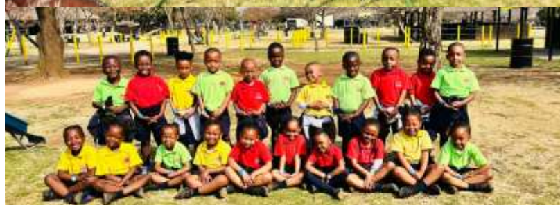
Grade RR and R Team, 2025